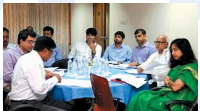
Distinguished participants in two different plenary sessions