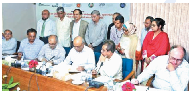
Guests at the policy workshop on Initiatives on Clustering of small scale fish/ shrimp farmer, opportunities for improving market linkages and access to credit