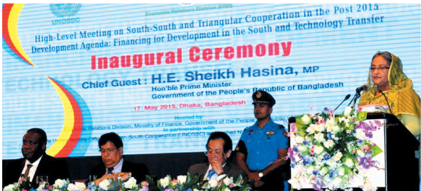
Prime Minister Sheikh Hasina speaks at the opening ceremony of the high-level meeting on South-South and Triangular Cooperation in the Post 2015 Development Agenda, at Pan Pacific Sonargaon Dhaka in the capital yesterday.

Developing countries should stop running after low-hanging fruits but rather develop connectivity among them to promote sustainable development, analysts said at the meeting. South-South Cooperation is the mutual sharing and exchange of development solutions - knowledge, experiences and good practices, policies, technology and resources - between and among countries in the global South.