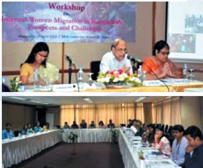
Guests and participants at the Workshop of Internal Women Migration

BRAC Institute of Governance and Development (BIGD), BRAC University organised a Workshop on 'Internal Women Migration in Bangladesh: Prospects and Challenges' on Wednesday, 29 th April 2015 at the BRAC Centre Inn Conference Room, Mohakhali, Dhaka.