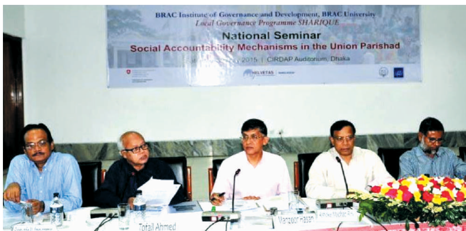
Distinguished Guests at the National Seminar on Social Accountability Mechanisms

Provision of Ward Shobha, twice in a year, promulgated in the Local Governance Act (UP) 2009, to ensure social accountability of Union Parishad through participation of men-women and poor in its activities and improving the quality of its service, the programme couldn't be successful all across the country, experts said in a National Seminar titled Social Accountability Mechanisms in the Union Parishads on May 30 th , 2015, jointly organised by BRAC Institute of Governance and Development (BIGD), BRAC University and HELVETAS Swiss Intercooperation, Bangladesh.