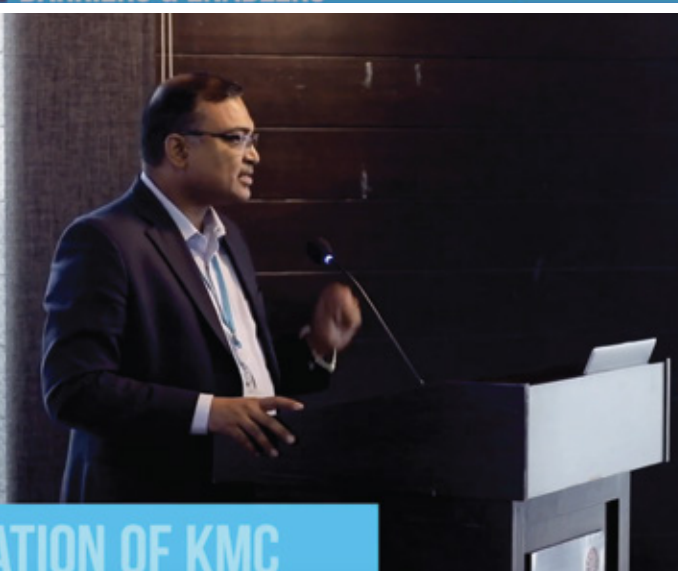
ATION OF KMC