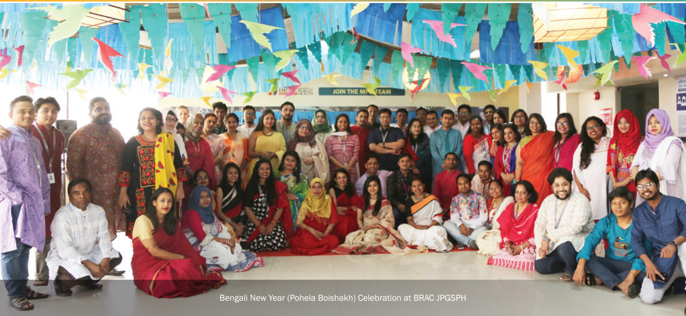
Bengali New Year (Pohela Boishakh) Celebration at BRAC JPGSPH