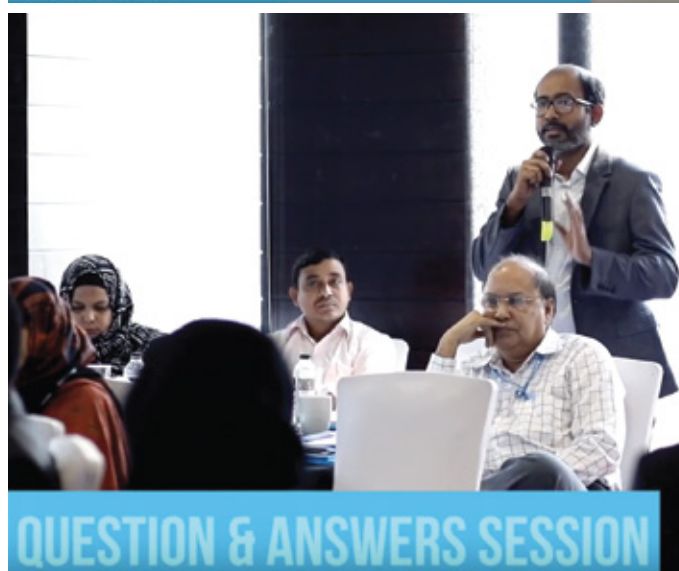
QUESTION & ANSWERS SESSION