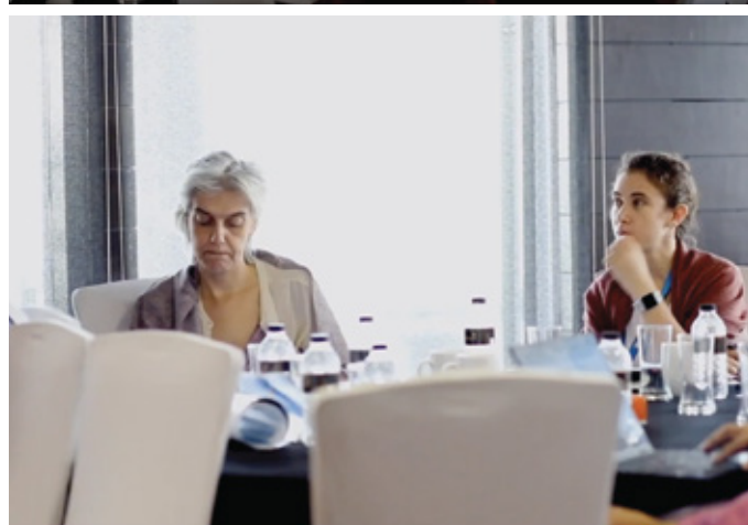
DISCUSSING SITUATION OF KMC IN BANGLADESH