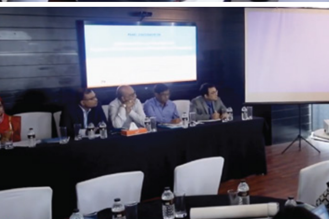
SHARING FINDINGS FROM KMC BARRIERS & ENABLERS